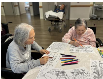
Art and creativity games