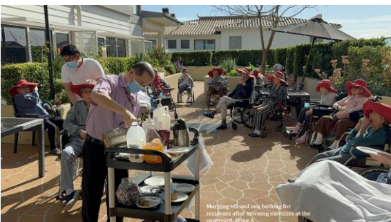
Morning tea and sunbathing for residents after morning exercises at the courtyard, being A...