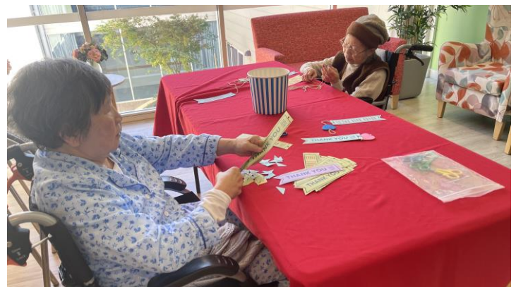
Residents did the hand crafts of the staff name tags with thank-you message together for making the nurse tree decoration with the meaning of appreciation toward nursing staff at AVACS Home on International Nurses Day 2024