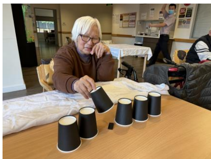
The hide and find game + sunbathing

At AVACS Home, we believed that staying active and engaged is key to the well-being of our residents. Our diverse range of indoor activities is designed to cater to the interests and abilities of each individual, ensuring that everyone has the opportunity to participate and enjoy. From arts and crafts to music therapy, games and social gatherings, our programs not only provide entertainment but also foster a sense of community, purpose and joy. Our indoor programs have brought warmth and happiness to the hearts of our cherished residents.