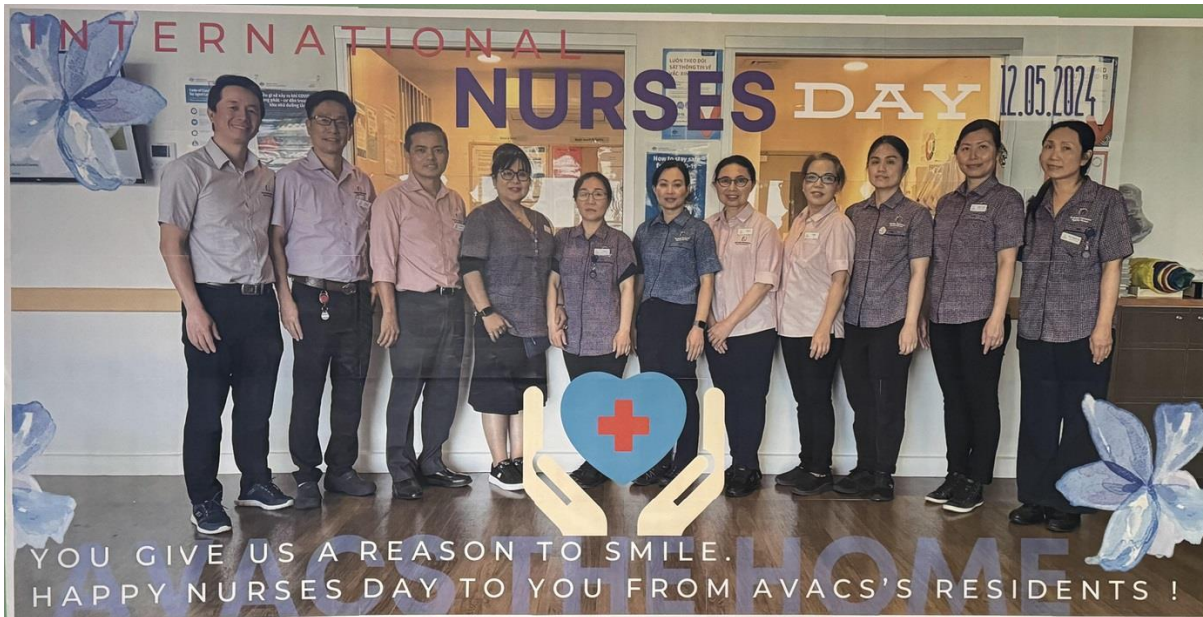
Representatives of Team members from RAO Team, and Nursing Team at our AVACS Home to celebrate the International Nurses Day