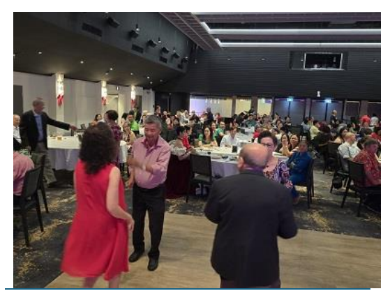
The evening was further enlivened by wonderful performances from our staff and their families, who showcased their singing and dancing talents. This not only brought joy to everyone present but also fostered a strong sense of community among all attendees. We are proud of the remarkable work done by our staff and look forward to another successful year of nurturing and caring for our residents.